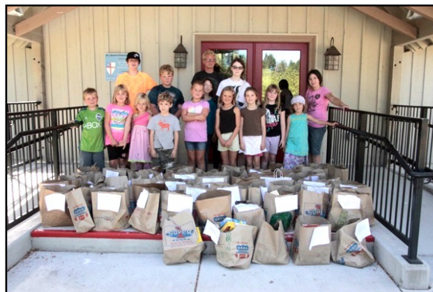
All Saints' Day Camp photos from previous years