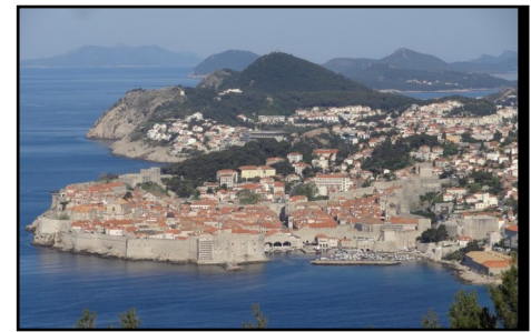
Above: Dubrovnik, Croatia