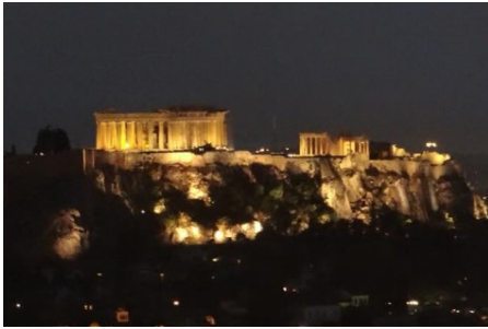
The Acropolis, Greece