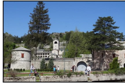
Cetinje Monastery, Montenegro