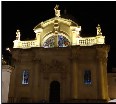
Church of St. Blaise, Dubrovnik, Croatia