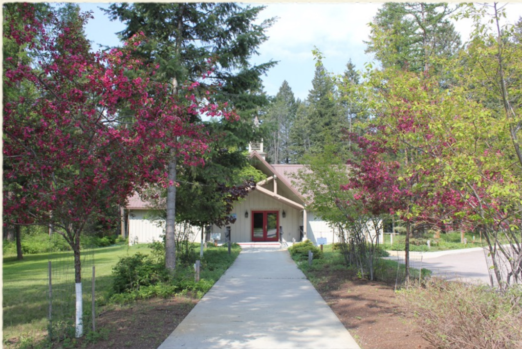
All Saints' Episcopal Church 2048 Conn Rd. Columbia Falls, Montana