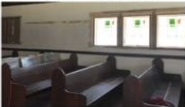
Aug 13 - old windows replaced