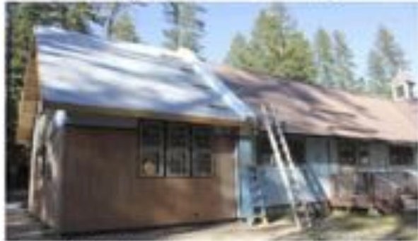
Aug 27 - siding around the back