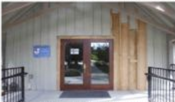
Aug 21 - front wall reframed