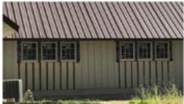
Aug 13 - old windows replaced