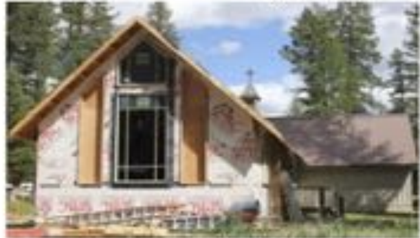
Aug 6 - a day of much change