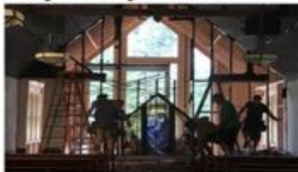
Aug 6 - safe on the ground - yay!