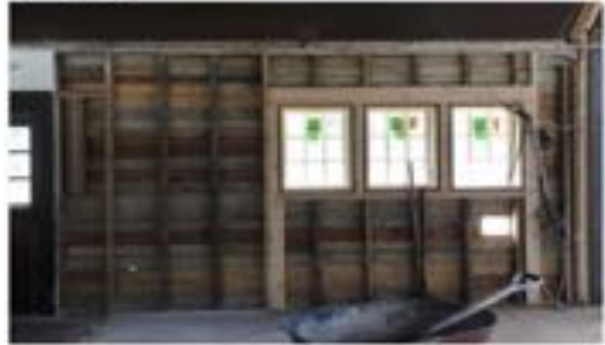
Aug 18 - new windows in old chancel area