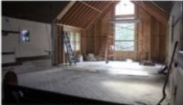
Aug 6 - platform removed