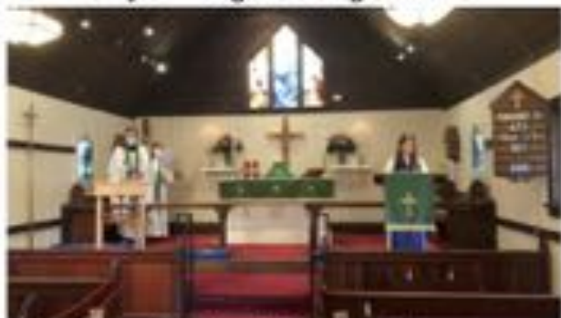
Aug 2 - last Eucharist before wall goes away