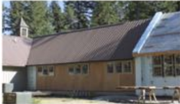
Aug 26 - start of new siding