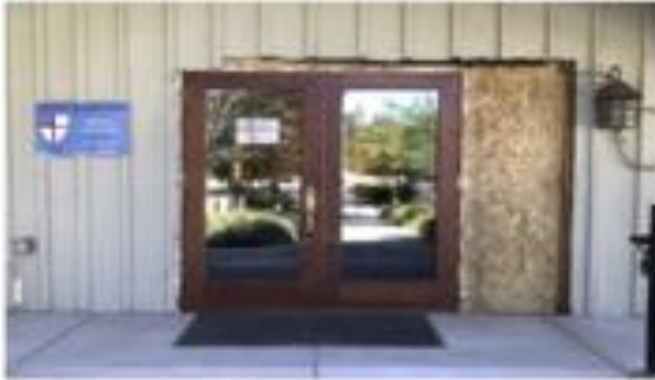
Aug 17 - front door changed