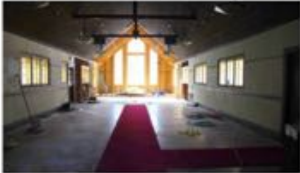
Aug 25 - ready for more interior remodeling