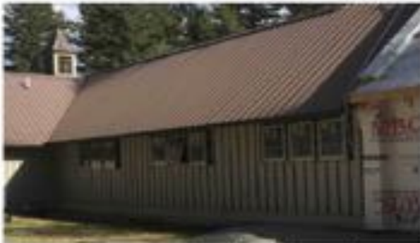
Aug 18 - new windows in old chancel area