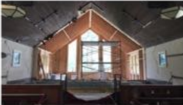
Aug 6 - back wall gone - next...the platform