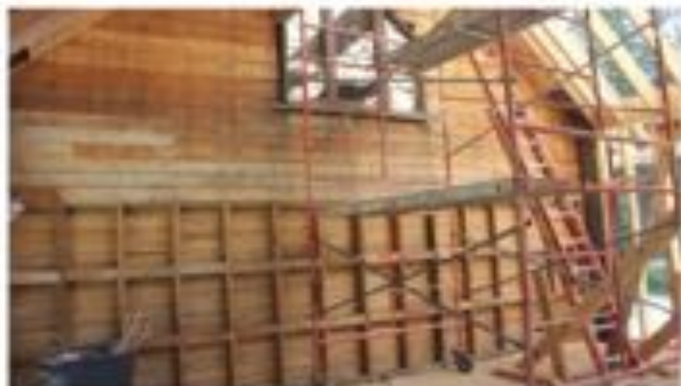
July 31 - original siding removed