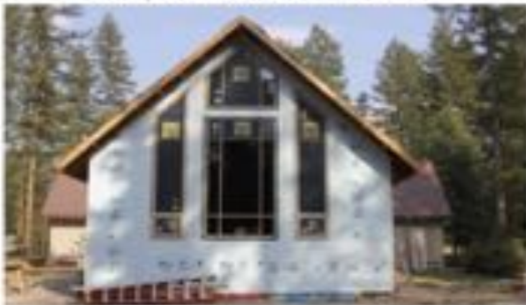
Aug 24 - last of the windows installed