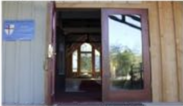
Aug 26 - view through the front doors