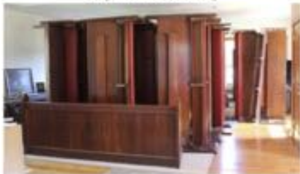
wondering where the pews are?...in Chr Ed