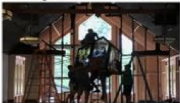
Aug 6 - half way down