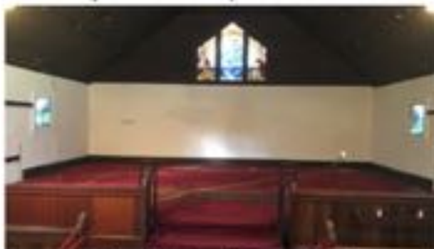
Aug 4 - chancel cleared out