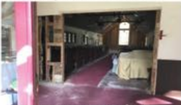
Aug 11 - inside doors removed