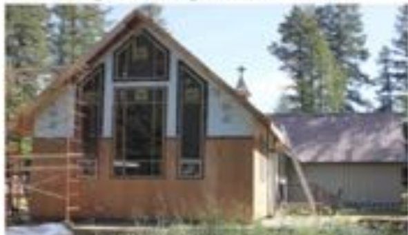
Aug 28 - more siding