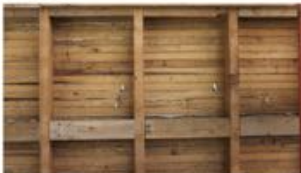
July 31 - lath and plaster revealed