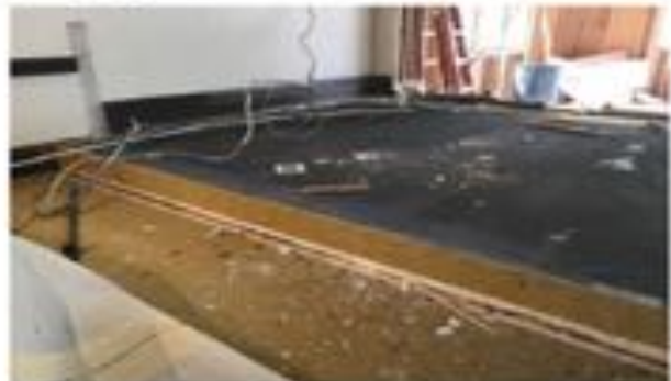
Aug 6 - who remembers gold carpet?