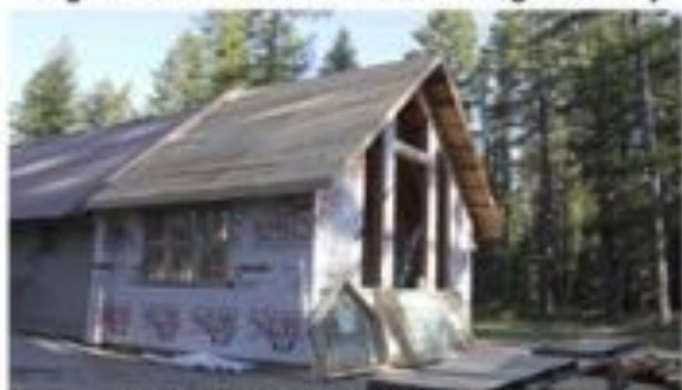
Aug 5 - windows in the addition