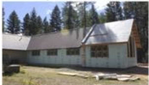
Aug 21 - outside insulation started