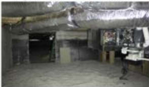
Aug 28 - new heating/cooling unit in crawl space