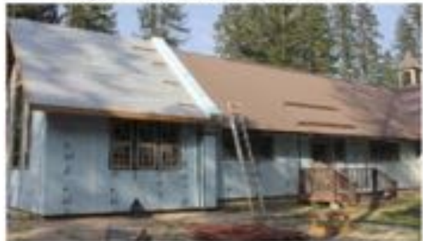
Aug 25 - insulation all around