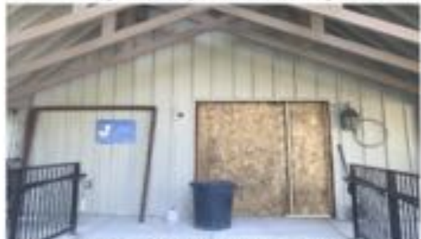
Aug 13 - front door removed