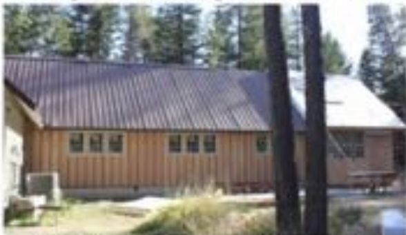
Aug 27 - new board and batten started