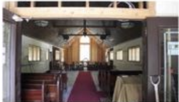
Aug 21 - pews detached