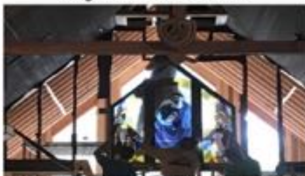
Aug 6 - stained glass starts to come out