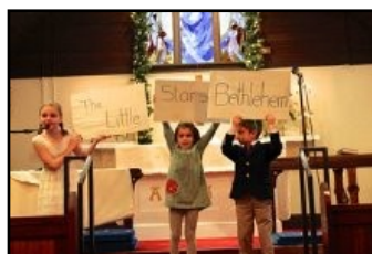
Photos from previous pageants