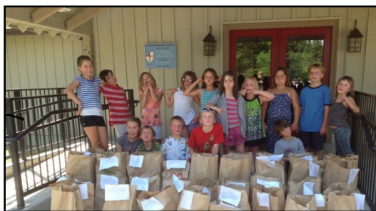
Photos from previous day camps

https://diomontana.com/camp-marshall/all-saints-cf-day-camp/