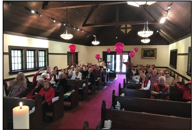
11 O'Clockers (and one stray 9 O'Clocker)